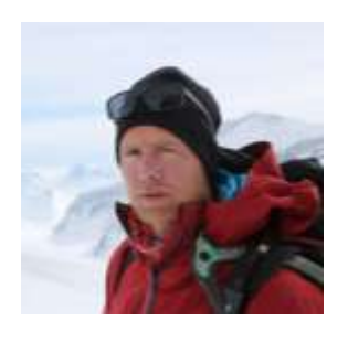
Leo Holding Adventure